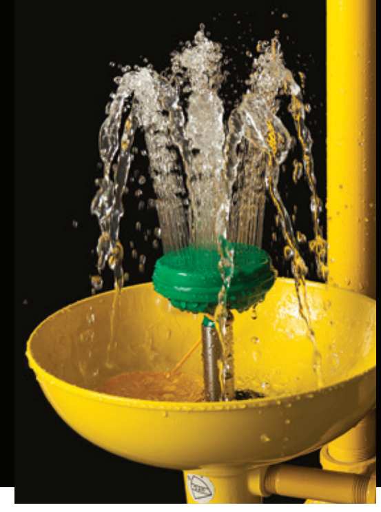
AXION Advantage eye/face wash head installed on Bradley Model $19-310FW

With four Advantage systems providing the necessary pieces to convert the majority of existing competitive eyewashes and showers, your facility will have the tools to upgrade older Haws products, replace ineffective competitive products, and test for continued ANSI compliance.