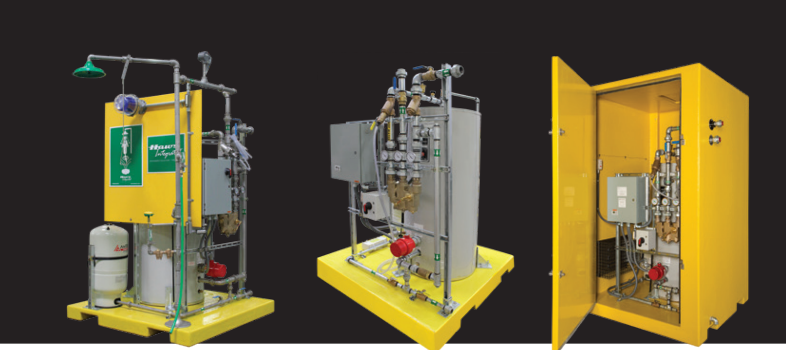
Model shown with additional light/alarm